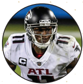
JULIO JONES [234]