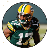
DAVANTE ADAMS [249]